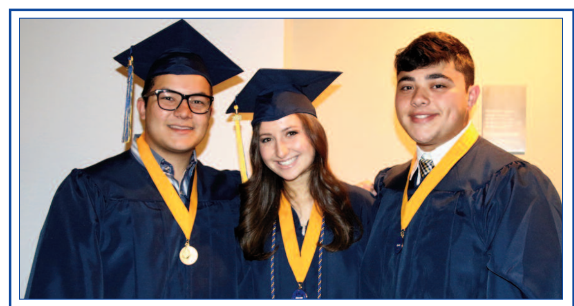
In Jericho High School's class of 2018, 99.9% of all seniors earned Regents diplomas and 91% received Regents Diplomas Awarded with Distinction. Also, 92% of our graduates completed at least one Advanced Placement course. Jericho's percentages in these categories are among the highest in New York State.