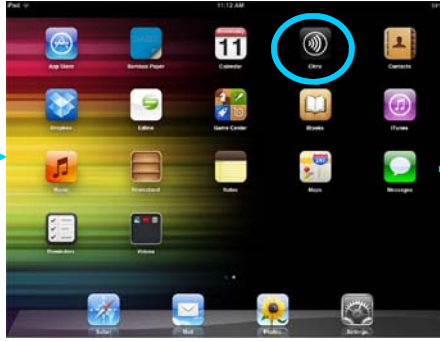
Choose the Applications you wish to use. Press the star next to the name...

After Citrix Installs on the Home Screen Run App