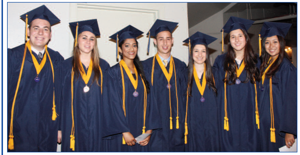
In Jericho High School's class of 2013, 99% of all seniors earned Regents diplomas and 87% received Regents Diplomas Awarded with Distinction. Also, 88% of our graduates completed at least one Advanced Placement course. Jericho's percentages in these categories are among the highest in New York State.