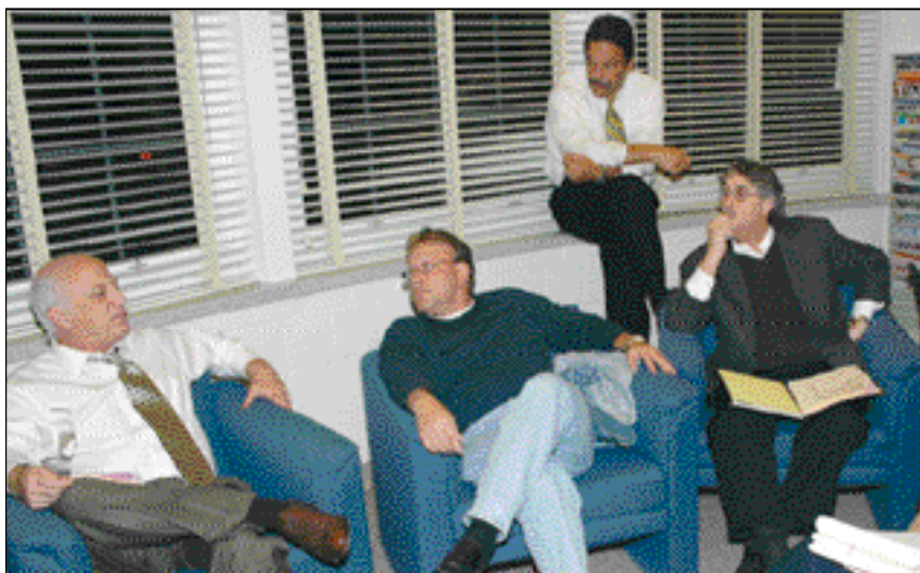
Breakout groups reflect and discuss the information presented, as well as react to the data and request additional information.