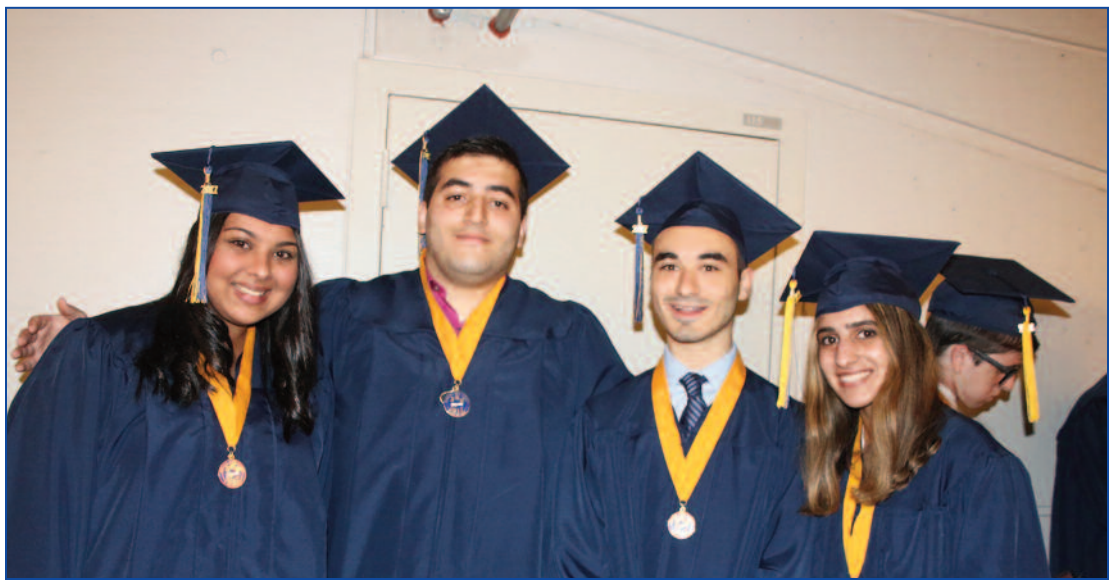
In Jericho High School's class of 2017, 99.9% of all seniors earned Regents diplomas and 93% received Regents Diplomas Awarded with Distinction. Also, 91% of our graduates completed at least one Advanced Placement course. Jericho's percentages in these categories are among the highest in New York State.