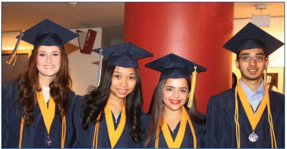
In Jericho High School's class of 2016, 99.3% of all seniors earned Regents diplomas and 89.2% received Regents Diplomas Awarded with Distinction. Also, 91% of our graduates completed at least one Advanced Placement course. Jericho's percentages in these categories are among the highest in New York State.